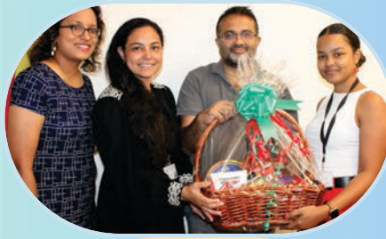
Medium Offices 1st Position Tax & Policy