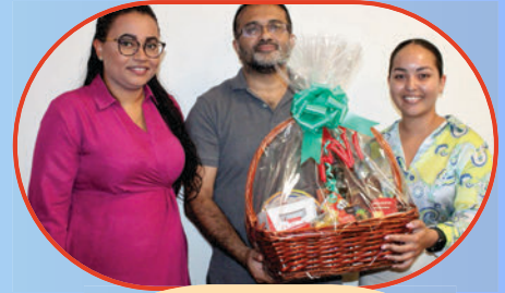
Large Offices 1st Position Trade Department