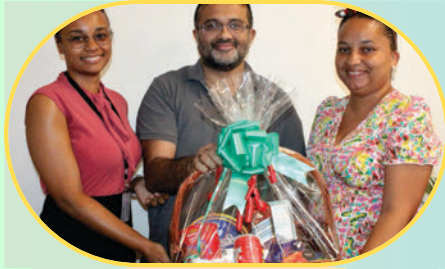
Small Offices 1st Position Debt Management Division

The Human Resources Division organised an Office Christmas Decoration Competition, where staff went all out with their creativity and innovation to claim the first spot. Offices were categorised in 3; small, medium and large, depending on the number of staff. Staff were given a clean slate to let their creativity run wild. There were seven judges from different divisions and on Monday 23rd, the winners were announced. Photo gallery of the winners and the decorations from all the offices that participated.