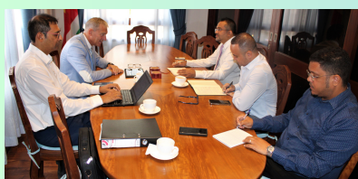
Ambassador of European Union