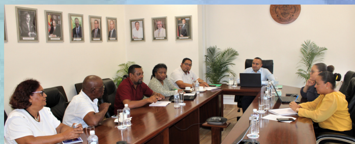
Citizens Engagement Platform Seychelles

When the Appropriation Bill is approved by the National Assembly, it will be assented into law, by the President.