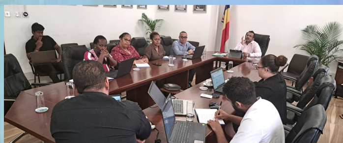
Ministry of Finance, National Planning and Trade