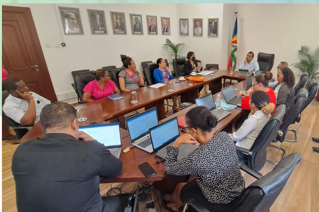
Ministry of Employment and Social Affairs

The preparation of the national budget for the year 2024, got underway in March, where officials from the Ministry kick started the process by holding initial meetings with accounting officers of all MDAs.