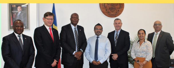
Representatives of ABSA Group