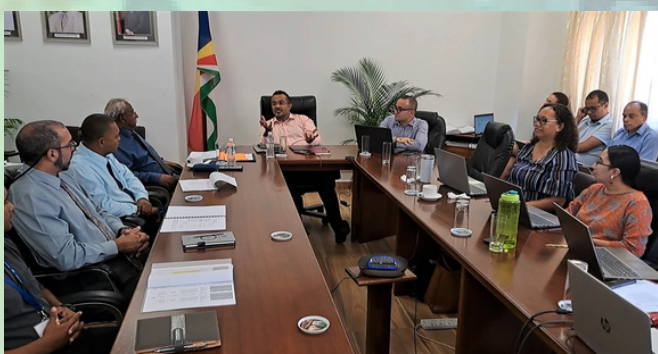
Ministry of Internal Affairs