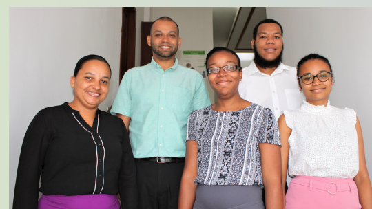
The Debt Management Division Team

The 10-year Bond is in line with the Government's strategy to lengthen the maturity of its debt profile and meet market demand for longer-tenure bonds.