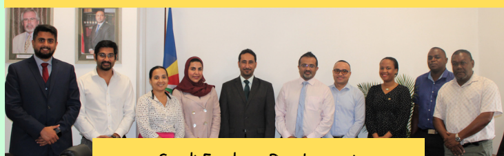
Saudi Fund for Development