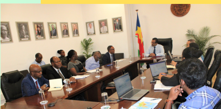
Representatives of AfDB