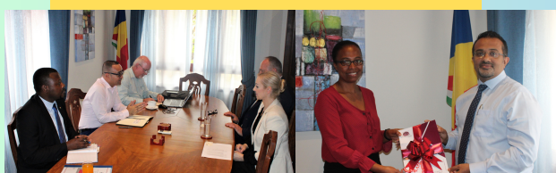
Ambassador of Poland