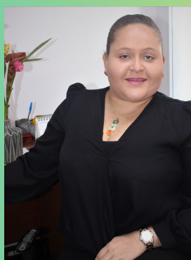
Astride Tamatave Comptroller General