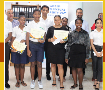
A souvenir group photo